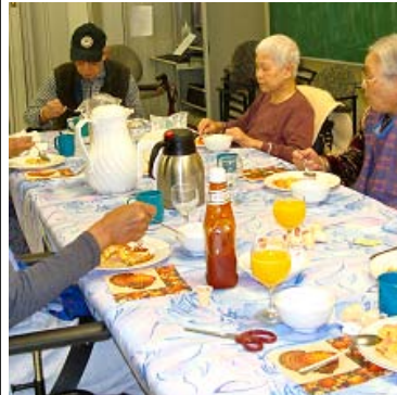
The Breakfast Club