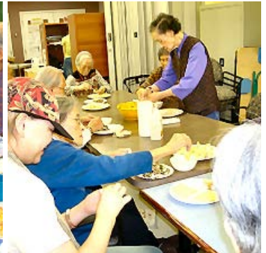
The Cooking Group