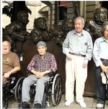
Hockey Hall of Fame trip