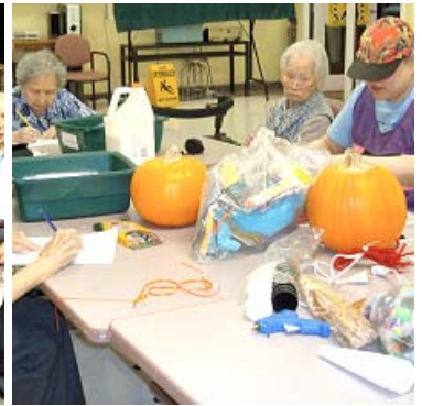
The Art Group