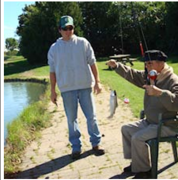
Looks like fish for supper!