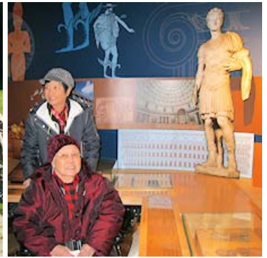
Bata Shoe Museum trip